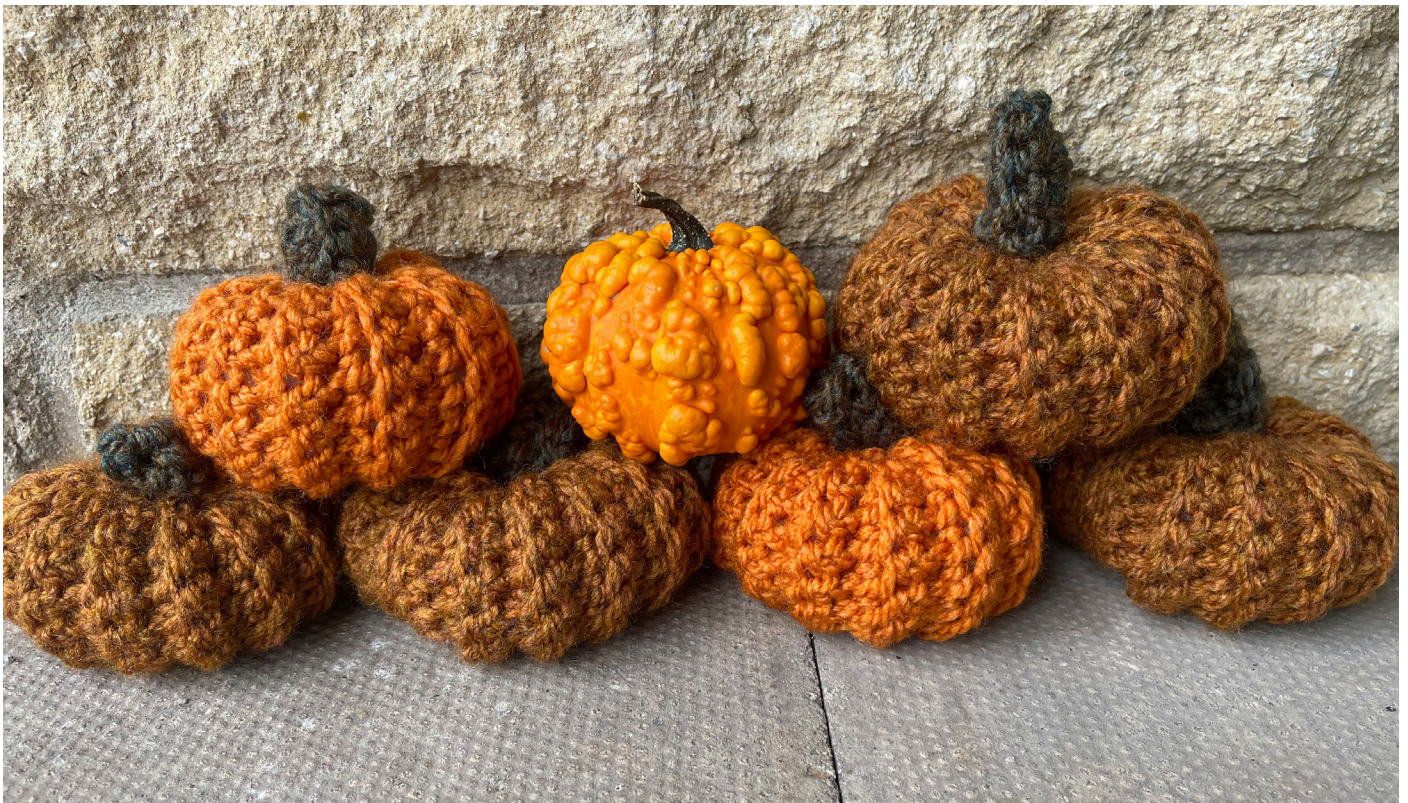
Above pumpkins crocheted in Burnt Orange, Spice, and the stems are crocheted in Bracken