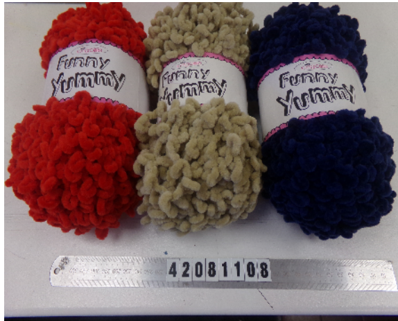
Photo of submitted sample

I certify that the above mentioned sample has been tested in accordance with the standard / regulation(s) specified below and that it complies or otherwise as follows: