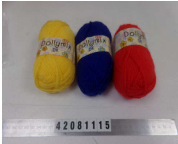
Photo of submitted sample

I certify that the above mentioned sample has been tested in accordance with the standard / regulation(s) specified below and that it complies or otherwise as follows: