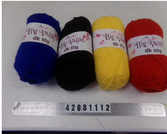
Photo of submitted sample

I certify that the above mentioned sample has been tested in accordance with the standard / regulation(s) specified below and that it complies or otherwise as follows: